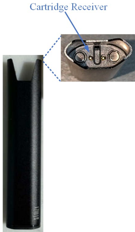
Figure 3: Illustration of cartridge receiver

24. Upon information and belief, Defendants' Accused Products include at least STIIIZY 1 Gram Vaporizer Cartridge, STIIIZY 0.5 Gram Vaporizer Cartridge, STIIIZY (Original) Vaporizer with STIIIZY 0.5 Gram Vaporizer Cartridge, STIIIZY (Original) Vaporizer with STIIIZY 1 Gram Vaporizer Cartridge, STIIIZY BIIG Vaporizer with 0.5 Gram Vaporizer Cartridge, STIIIZY BIIG Vaporizer with 1 Gram Vaporizer Cartridge, STIIIZY LIIL Vaporizer, and components thereof.